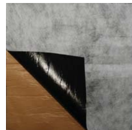
TRAY TILING MEMBRANE SAMPLE

Butyl-rubber / self-adhesive membrane with non-woven polyester facing. Membrane factory-applied to tray providing a tileable surface for modified thinset tile adhesive. See 'Approved Waterproofing and Adhesives' PDF.